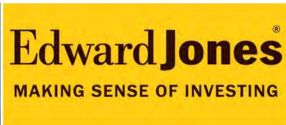
edwardjones.com Member SIPC