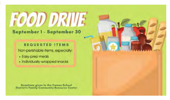
The donation box is located inside the Library near the north entrance.