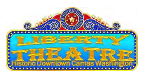
Click HERE For Showtimes